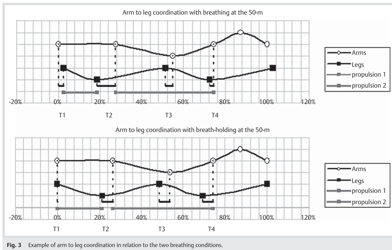
Fig. 3 Example of arm to leg coordination in relation to the two breathing conditions.

Conversely, it was hypothesised that a late exit of the hand in relation to the end of the downward leg kick (corresponding to high value of T4) would lead to lifting the head up and back because the arm recovery would be out-of-phase.